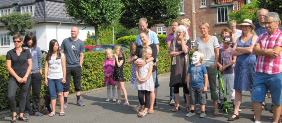
Rigtigt mange der var klar til indvielsen af Løveparken